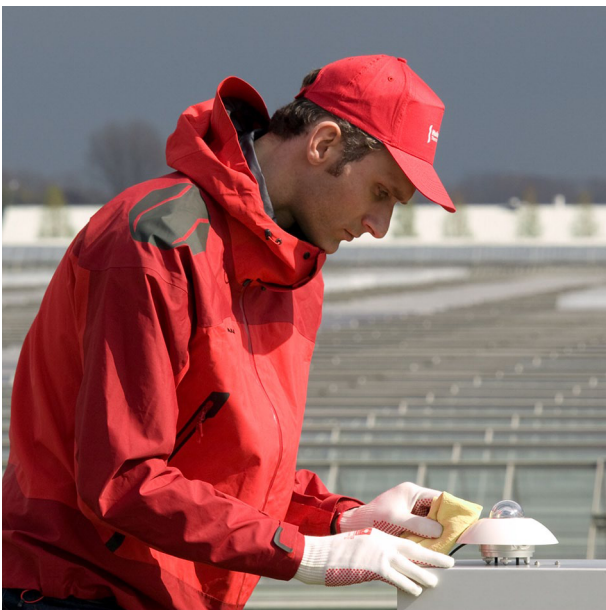
Figure 2 SR11 pyranometer in greenhouse application