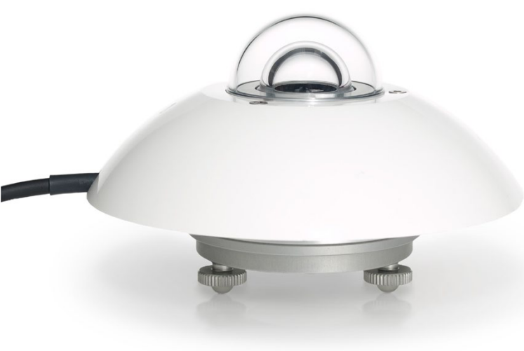
Figure 1 SR11 first class pyranometer

SR11 is a high accuracy solar radiation sensor. SR11 first class pyranometer complies with the first class specifications of the ISO 9060 standard and the WMO Guide. It is the preferred instrument for outdoor PV system performance monitoring, according to the ASTM E2848 standard.